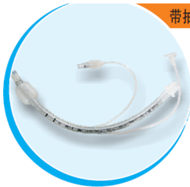
带抽吸气管插管(加强型) Endotracheal Tube with Aspiration Lumen