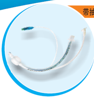
带抽吸气管插管(普通型) Endotracheal Tube with Aspiration Lumen