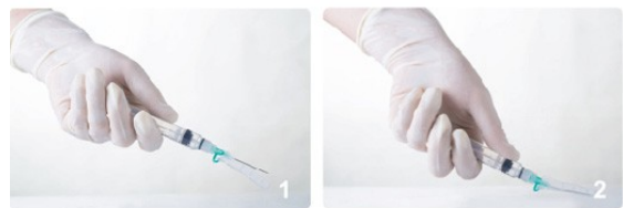
Knock the safety cap slightly After injection