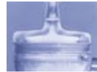
CAPIOX HC series

The entire housing, including blood ports, is transparent for easy visual checking.