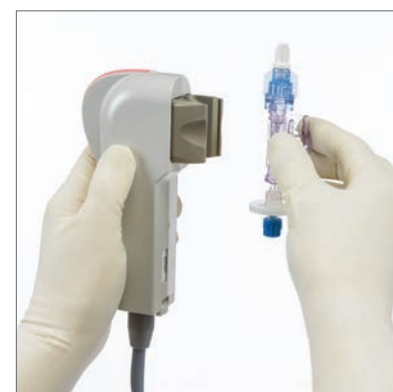
The shunt sensor is placed in the cable head.