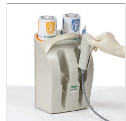
The cable head, with sensor attached, is placed in the calibrator.